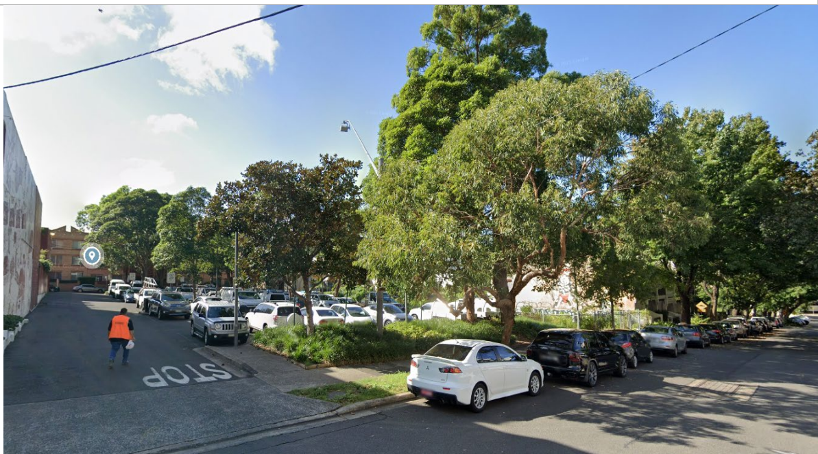
Facing east from Cope St – foreground showing carpark exit to Cope St. 35 Cope Street left of driveway.