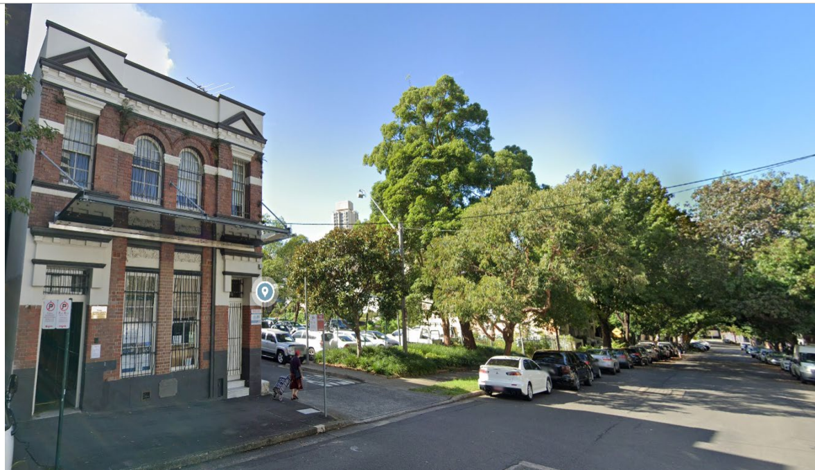
Facing south along Cope Street Left: Wyanga 35 Cope St - Wyanga Aboriginal Aged Care Inc