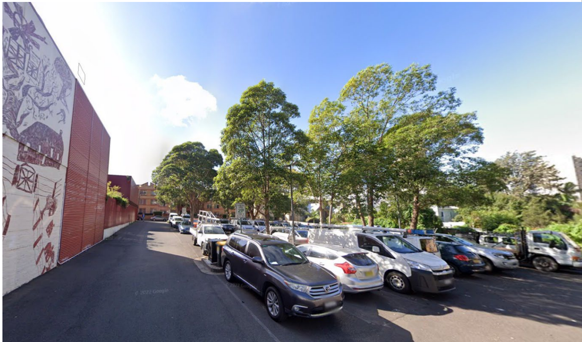
Facing east to Renwick Street from within the public carpark. Wyanga Aboriginal Aged Care Inc property to immediate left adjoining leased area with red shaded improvements.