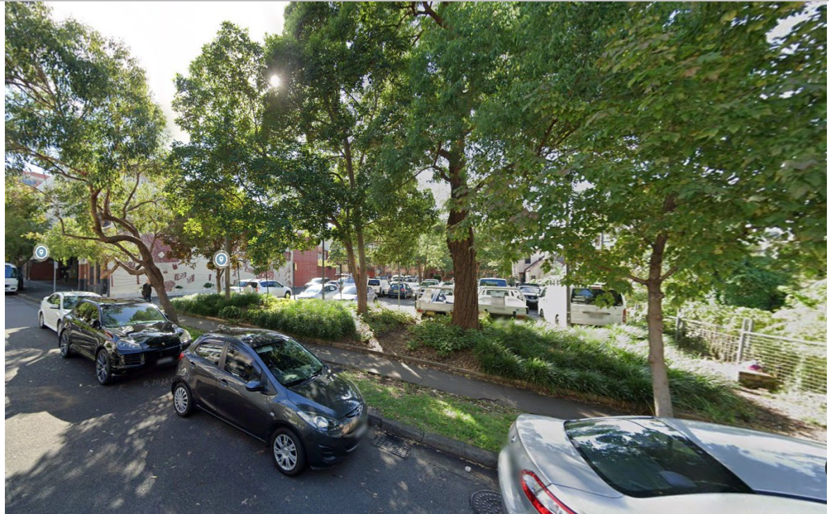
From Cope Street facing north-east – showing the public carpark. Wyanga Aboriginal Aged Care Inc property in background to left